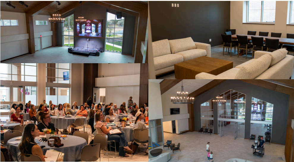
The Gathering Place will house mid-size groups of up to 350 people with comfortable breakout space, doubling as a chapel for weddings and funerals.