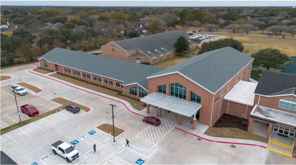
Building The Gathering Place on the Cinco Ranch campus empowers Grace Fellowship to better equip more disciples and make room for families to build authentic relationships.