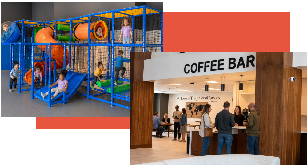
The highly relational space will also feature an indoor children's play-scape and coffee bar.